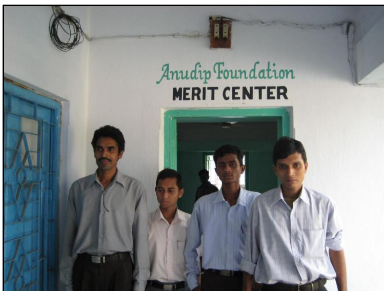
(Anudip MERIT Center)

Projects undertaken at MERIT Center are from reputed companies and institutions. Accounts preparation, registration conference participants of Alumni, database, Insurance claim processing, work of add compiling and others are carried.